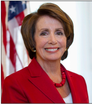
Nancy Pelosi (D—California) is the current Speaker of the House.