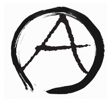
An A inside a circle is the traditional symbol for anarchy.